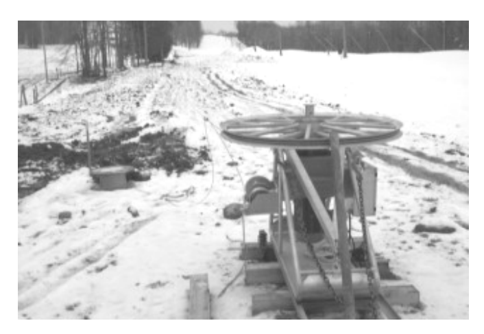
Figure 2 - The bottom of Hunt Hollow's new surface lift being installed.