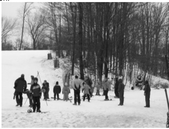
Figure 1 - Powder Mills Opening Day

Unfortunately, opening day was a little on the wet side, but it did not seem to "dampen" the enthusiasm of the youngsters. We had a full complement of patrollers, instructors and novice skiers of all ages to start out the season.