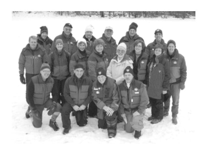
Figure 1 – Members of the National Outstanding Awardwinning Genesee Valley Nordic Patrol at their on-trail refresher on December 6th.