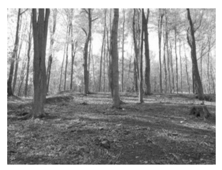
Figure 3 - A portion of Hunt Hollow's new glade skiing trail between Cascade and Ragged Edge (looking uphill).

Hunt Hollow will be opening some new terrain for skiing this year. The club along with a lot of help from the Hunt Patrol cleared two areas for "Glade" skiing. One of the areas is an expert trail between Cascade and Ragged Edge. This area will be designated as a double black diamond slope and will be a welcome new and exciting area to ski. The other area is adjacent to an intermediate slope near Lower Dipper. This is a more gentle area for those less experienced in tree skiing.