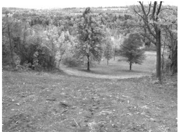
Figure 12 - The Brantling "West Bowl"