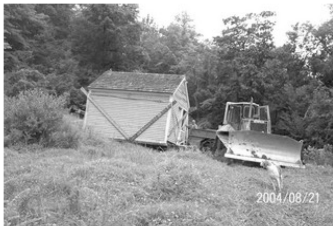
Figure 7 - The hut coming down Ski Valley