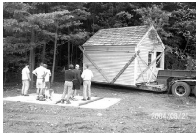
Figure 8 - The hut arriving at the top of Hunt Hollow