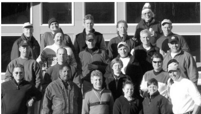
Figure 1 - The 2004 Candidate Class