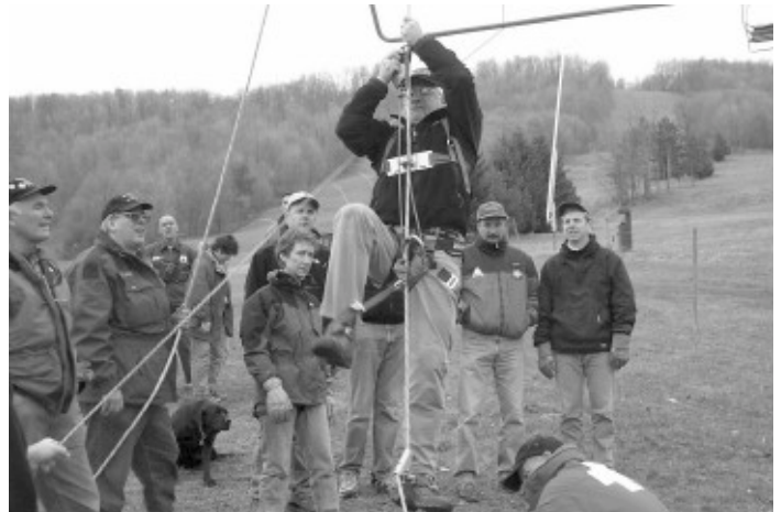
Figure 5 - Ascender demonstration at the Evac. Clinic.

A gathering of patrollers met this year at Hunt Hollow to share ideas, innovate new systems, shake the cobwebs out of the old systems and in general, have a good time eating chili. The excellent cross section from various patrols brought a variety of challenges to the table to be discussed and thrown about. Each person left a bit richer than when they arrived, a good sign of progress.