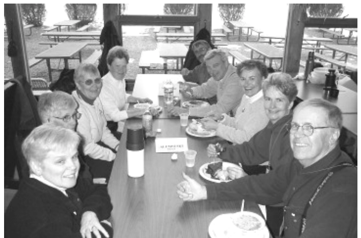
Figure 1 - Some of the Alumni enjoying lunch.