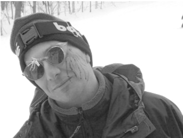
Figure 3 - The famous eye impalement moulage.

The weather and snow could not have been better. Sugarbush had 20+ inches of great new snow. This actually made the ski and toboggan portion of the test extremely difficult. Too much snow is just as bad as solid ice. Tom spent a good portion of Friday packing snow on the skills courses just so the candidates could run.