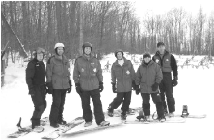
Figure 7 – The Advanced Board Clinic Participants

The Advanced Board Clinic, run by a PSIA Level III instructor, received general praise from the relatively few attendees. Most of the morning hours were devoted to general riding skills, culminating in some work with empty sleds. The afternoon was mostly devoted to loaded sled work on a variety of terrain, focusing on moguls. The day concluded with a couple of free fun runs.