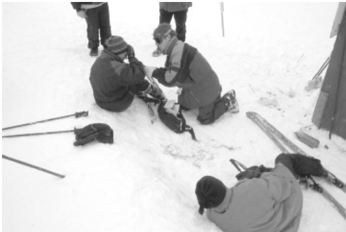
Figure 4 – Sr. OEC problem - two injured, one with an impaled ski pole.