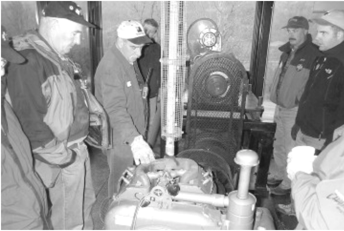
Figure 6 - An explanation of lift operation at the Evac. Clinic