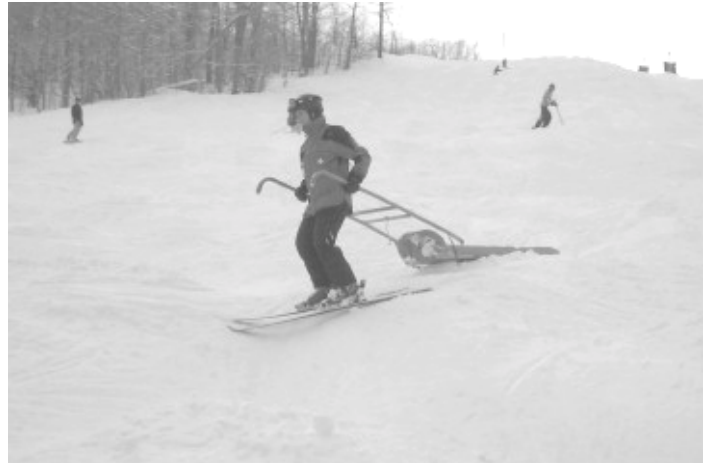
Figure 8 – Senior empty sled work in moguls

Campgaw Mountain in New Jersey and two from Swain. The first day featured challenging conditions after a period of freezing rain the night before, compounded by high winds. The second day was much better, culminating in a beautiful sunny afternoon.