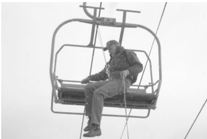
Figure 9 – Self-Evac. Practice at Hunt Hollow

This was a good year for Hunt Hollow and the patrol. In June we were fortunate enough to be able to offer transfers to six former Ski Valley patrollers; they are all outstanding and we are very happy to have them. They've "fit right in" and are contributing heavily. Soon after we went to work in mid-summer by building a deck on the hill-side of our patrol building. The funds for this were provided by generous contributions from a group of retired Hunt patrollers and design and hammer swinging was done by the active patrol. It looks good! Our fall On-Hill refresher was conducted in September on a nice day and featured practice on complete beginning-to-end accident scenarios and a fly-in visit by Mercy Flight. On November 4, Jeff Baker coordinated a Region Lift Evac Clinic, which was most interesting and enjoyable; this was followed by Jeff's famous chili and a selection of fine malt beverages (note I said followed) and a spirited discussion of the technical fine points. We think we found a good solution for the "very-small-child" evac case; give me a call if you are interested in this.