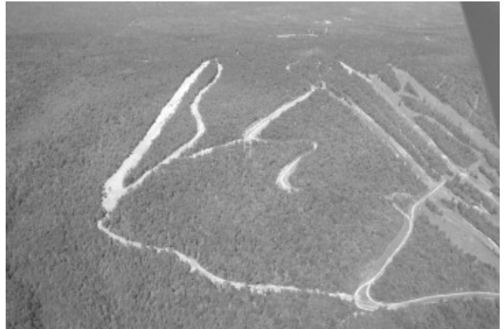
Figure 2 - Bristol's New Trails

CTEC will also be installing a new quad lift at the top of the mountain. Beginners are expected to use the two new gentle trails that the lift will service. The unloading ramp will be south of the existing quad and the lift will run along a gentle ridge that is roughly parallel to Southern Cross.