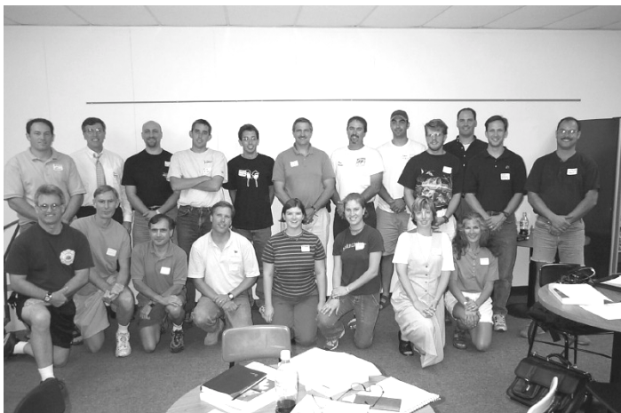
Figure 1 - The 2000 Candidates

September. Please contact Chris or me if you'd like to teach during the early fall.