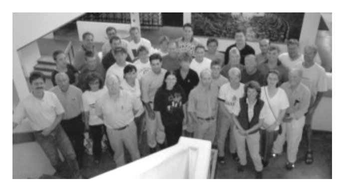
Figure 1 - The 2002 Candidate Class

time planned for the refreshers for the rest of the region. Please be sure to bring your first aid packs, as you will need them. As always, your finished test and money for eats to support the HF-L cross country team are also needed