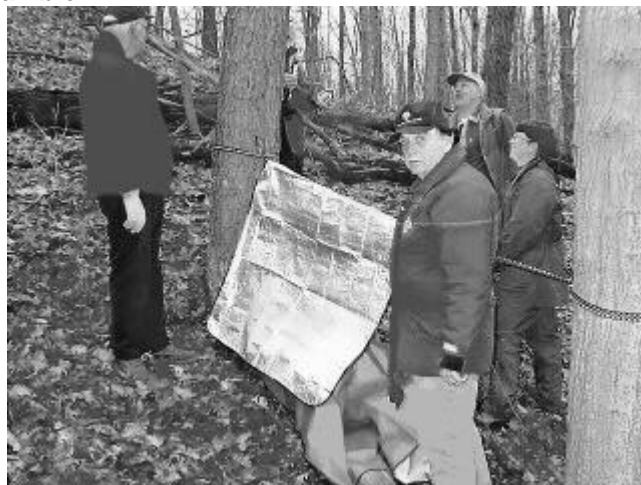
A shelter for a simulated injured skier.