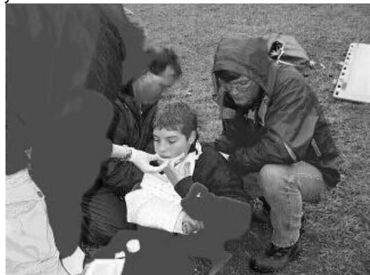
The Venturing crew portrayed injured skiers for the Candidate OEC practical evaluation.