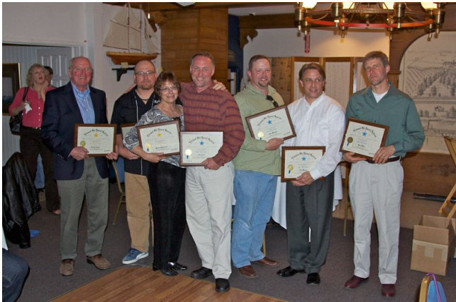
Illustration 6: The Blue and Yellow Merit Star recipients.