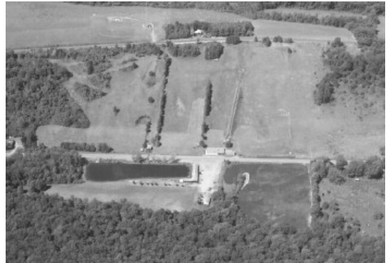
Figure 4 - Brantling