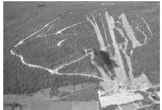
Figure 5 - Bristol