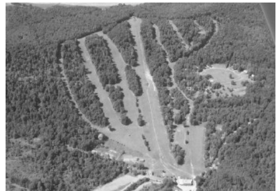
Figure 6 - Hunt Hollow