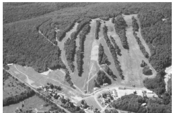
Figure 7 - Swain